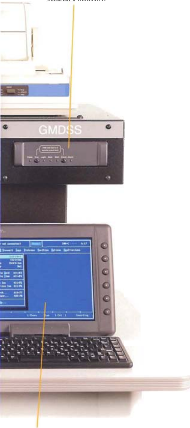
Inmarsat-C Message Terminal